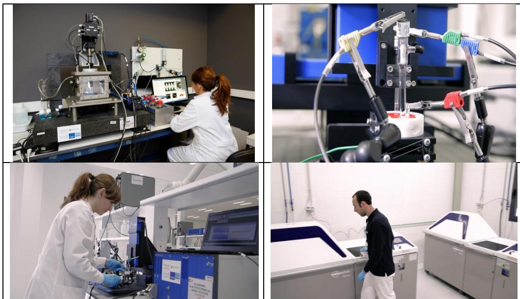
Photos: Certain facilities for corrosion characterization at CIDETEC Surface Engineering

( https://cordis.europa.eu/project/id/864905 ). It is coordinated in collaboration with 4 partners (UBFC, MISTRAS, TITANIA, INSA and with Dassault Aviation as topic manager) by CIDETEC Surface Engineering, a private organization for applied research founded in 1997 and located in the Scientific and Technological Park of Donostia-San Sebastián (Gipuzkoa, Spain). CIDETEC Surface Engineering is specialized in providing innovative solutions throughout the entire value chain for the automotive, aerospace and extreme environment sectors, among others, such as detailed characterisation of bulk materials and surfaces, design of tailor-made materials and surface treatments, industrial scale-up of different coating and surface modification techniques, development of different coatings (surface solutions) for protection against corrosion/tribocorrosion. CIDETEC's facilities are fully equipped for corrosion control and monitoring (accelerated corrosion tests, conventional electrochemical tests and localized ones), and to produce/apply base formulations using a broad range of technologies (anodizing, electrodeposition, dip, spray, electrophoretic deposition, flow coating, etc.) at laboratory and industrial scale.